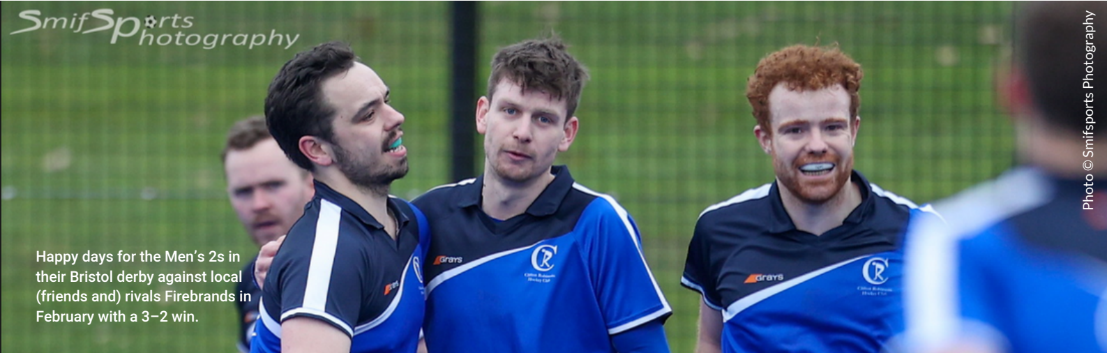
Happy days for the Men's 2s in their Bristol derby against local (friends and) rivals Firebrands in February with a 3-2 win.