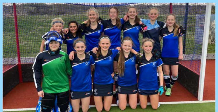
U16G Tier 1 team who beat Stourport 4-0 to qualify for the EH National Finals.